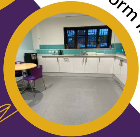
Sixth Form Kitchen